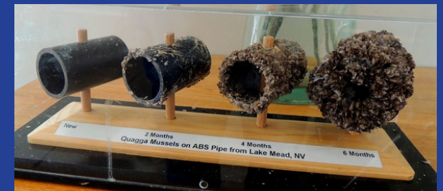
Quagga Mussels on ABS pipe from Lake Mead, NV.

Thanks for being a responsible boater, have a safe and enjoyable season!