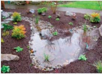
Newly-planted rain garden

Compared to a patch of lawn, a rain garden allows ~30% more water to soak into the ground. Rain gardens work effectively by using tolerant native plants and organic, absorbent soils.