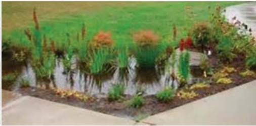
Rain garden after a storm event