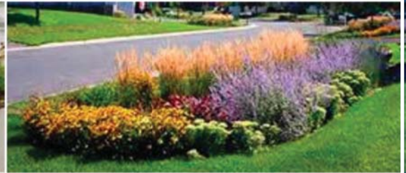
Well-established rain garden