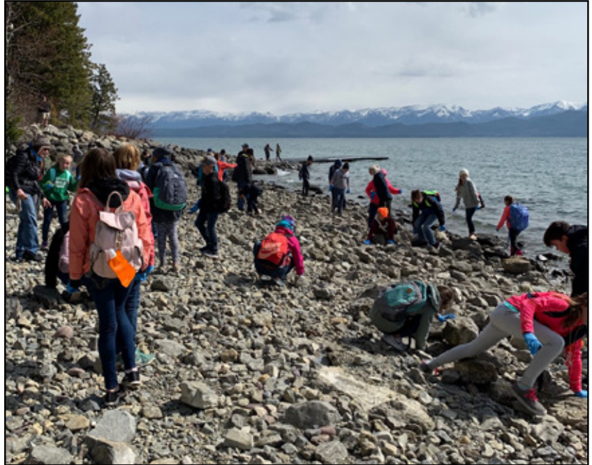
Students search for invasive mussels on Flathead Lake during the 2019 Mussel Walk. We're happy to report no mussels were found.

Somers, Ronan, Polson, Bigfork, and Whitefish middle school students participated in pilot lessons for a new "Be AIS Aware" curriculum and educational trunk