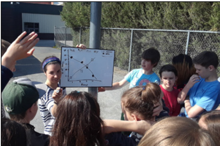
A musical chairs activity shows middle school students how native species populations are under threat from and are out-competed by invasive species.